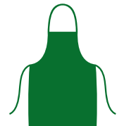
Gowns or aprons

This will help ensure that bacteria from potentially infected animals do not get into eyes or inside a cut or abrasion on the skin.